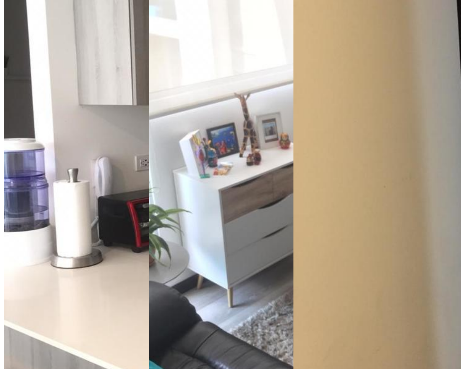
• Status: Active/Published

• Property Type: Condo • Bedrooms: 3 • Built: 2019 • Size: 116 sq m • 0.03 Acres • Floor Area (SQFT): 1,249