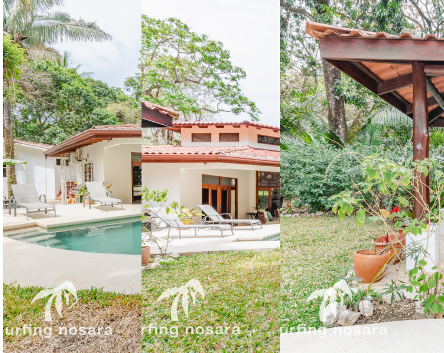
• Status: Active/Published

• Property Type: Single Family Homes • Bedrooms: 5 • Floor Area (SQFT): 108