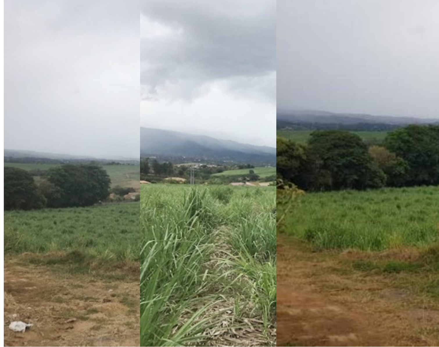
• Status: Active/Published

• Property Type: Land • Size: 87161 sq m • 21.54 Acres