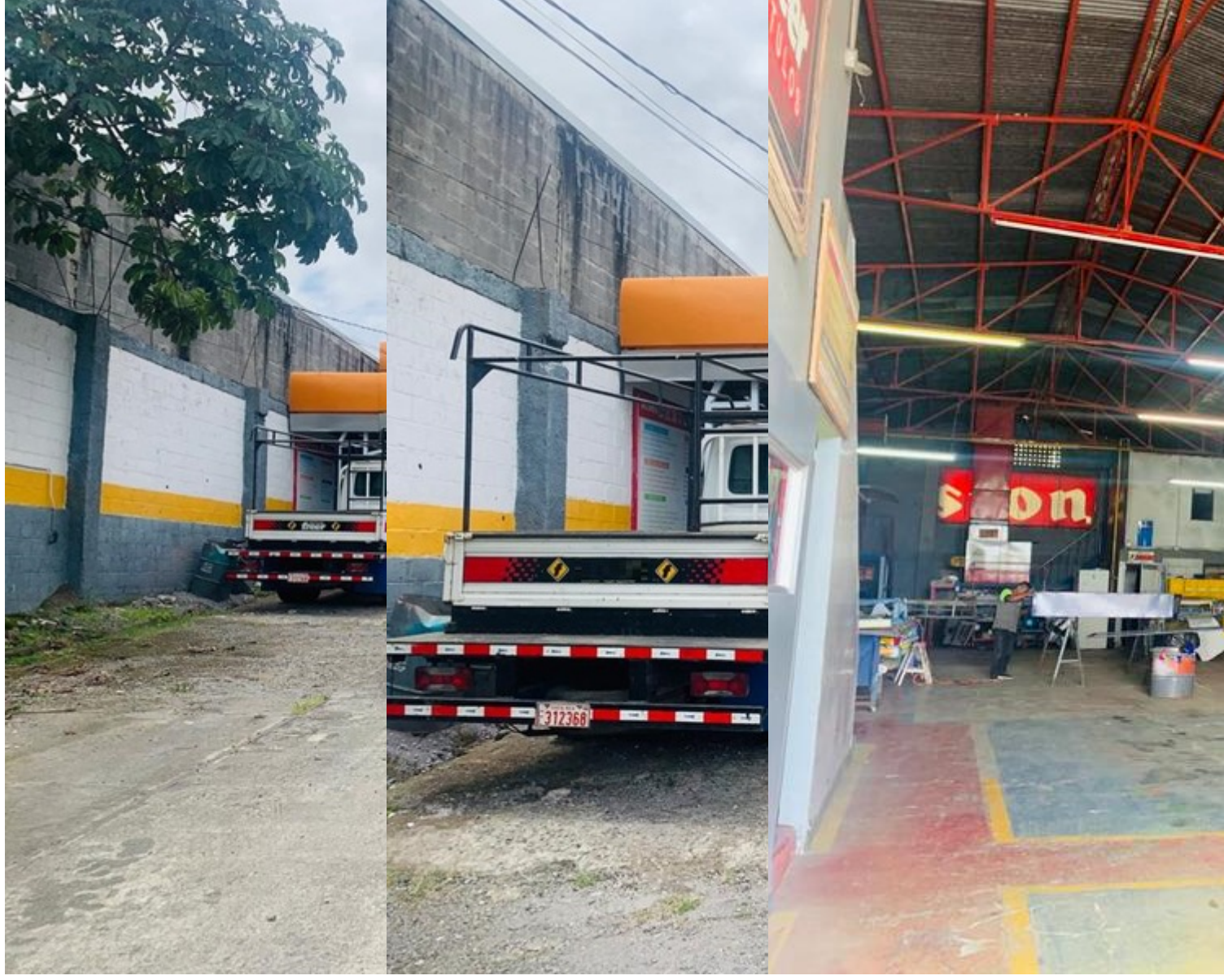
• Status: Active/Published

• Property Type: Commercial • Bedrooms: 1 • Built: 1990 • Size: 839 sq m • 0.21 Acres • Floor Area (SQFT): 4,844