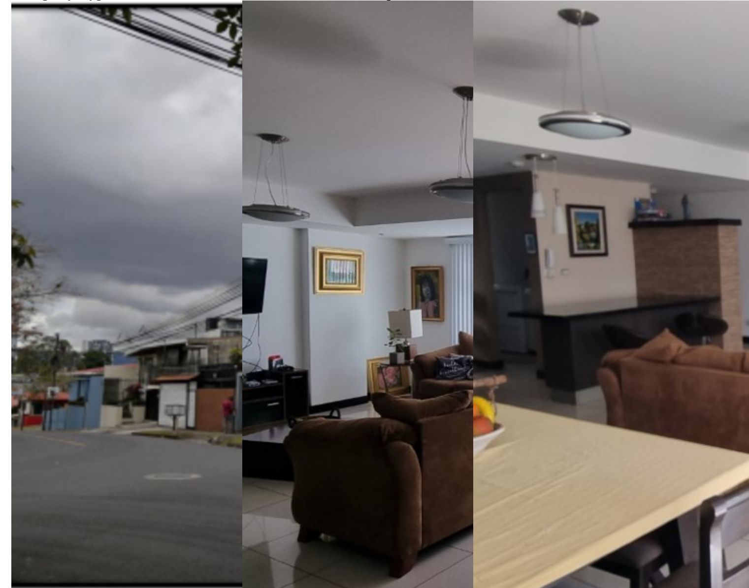
• Status: Active/Published

• Property Type: Commercial • Bedrooms: 11 • Size: 700 sq m • 0.17 Acres • Floor Area (SQFT): 4,844