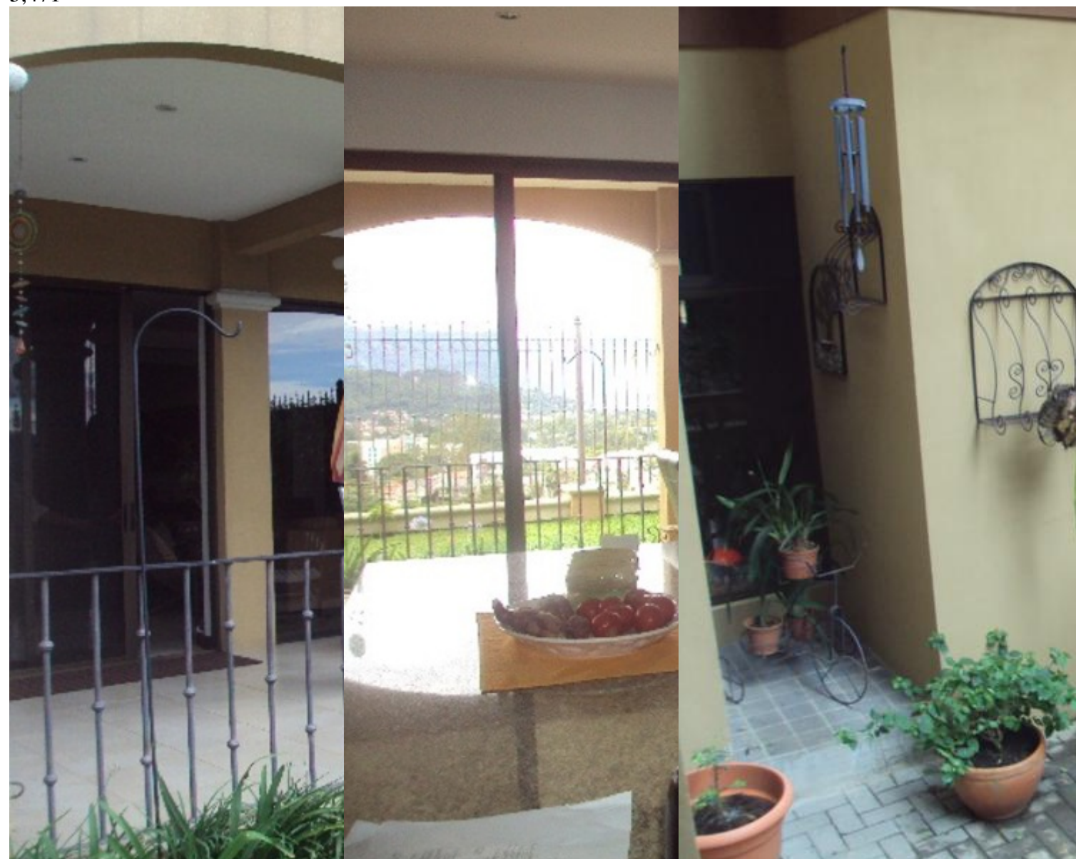
• Status: Sold

• Property Type: Condo • Bedrooms: 5 • Built: 2011 • Size: 508.3 sq m • 0.13 Acres • Floor Area (SQFT): 5,471