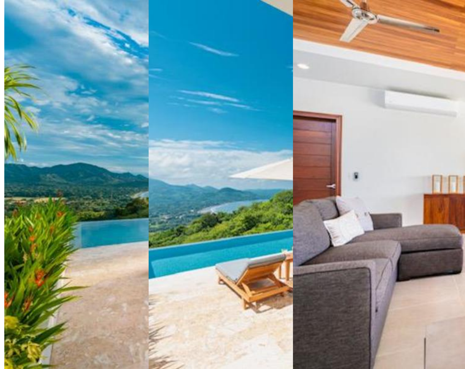
• Status: Sale Pending

• Property Type: Single Family Homes • Bedrooms: 5 • Built: 2018 • Floor Area (SQFT): 54,251