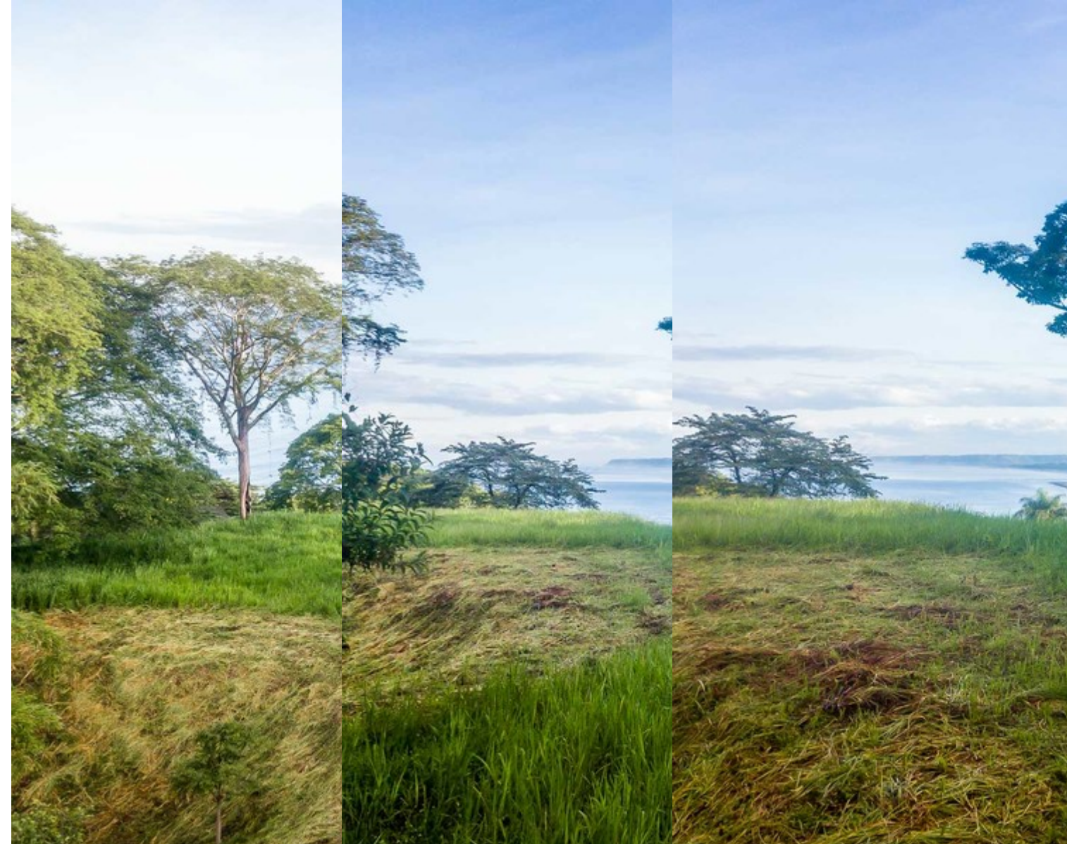
• Status: Active/Published

• Property Type: Land • Size: 5005 sq m • 1.24 Acres