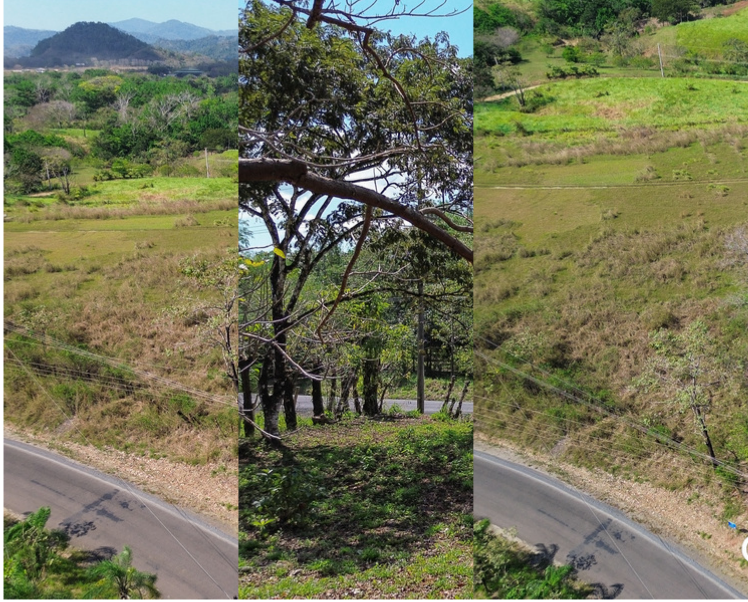
Status: Active/PublishedClose To Transport

• Property Type: Land • Size: 992 sq m • 0.25 Acres