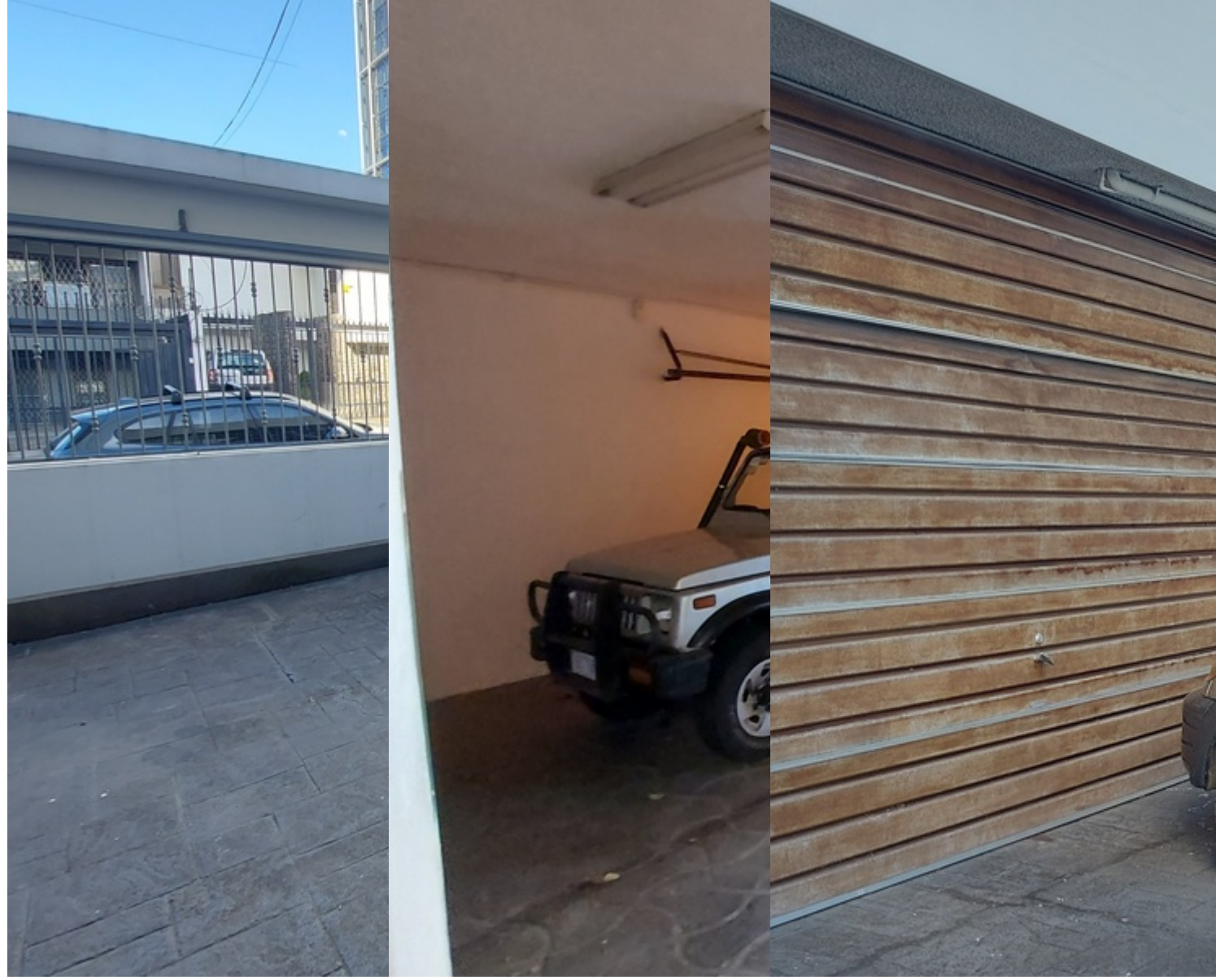
Status: Active/PublishedClose To Shops

• Property Type: Commercial • Bedrooms: 6 • Built: 1985 • Size: 400 sq m • 0.1 Acres • Floor Area (SQFT): 3,229