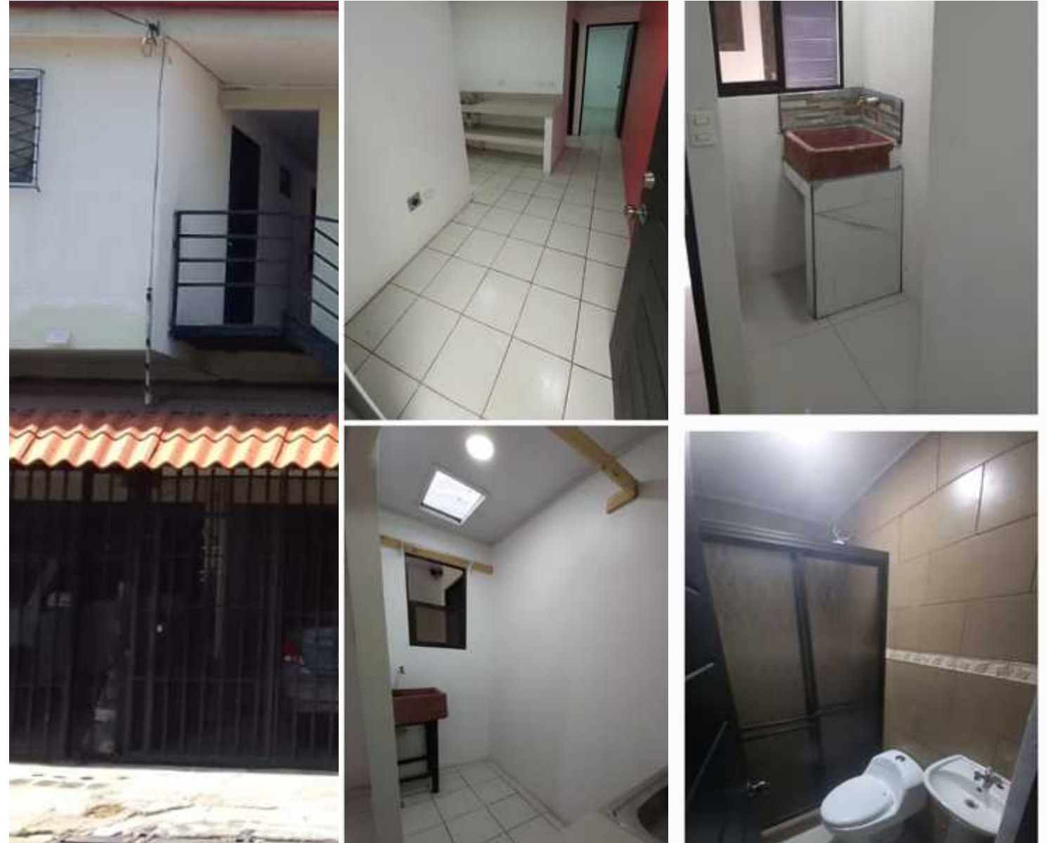
• Status: Active/Published

• Property Type: Commercial • Bedrooms: 24 • Built: 2017 • Size: 355 sq m • 0.09 Acres • Floor Area (SQFT): 8,073