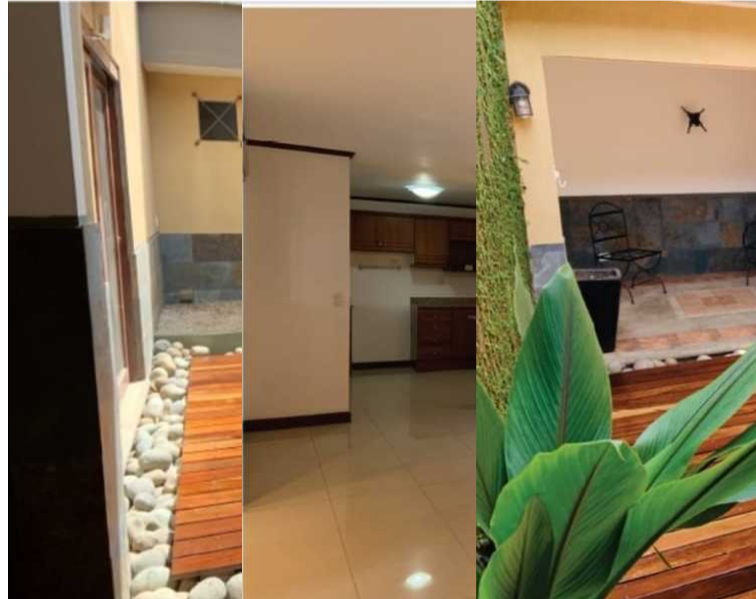
• Status: Active/Published

• Property Type: Single Family Homes • Bedrooms: 3 • Built: 2022 • Size: 200 sq m • 0.05 Acres • Floor Area (SQFT): 2,034