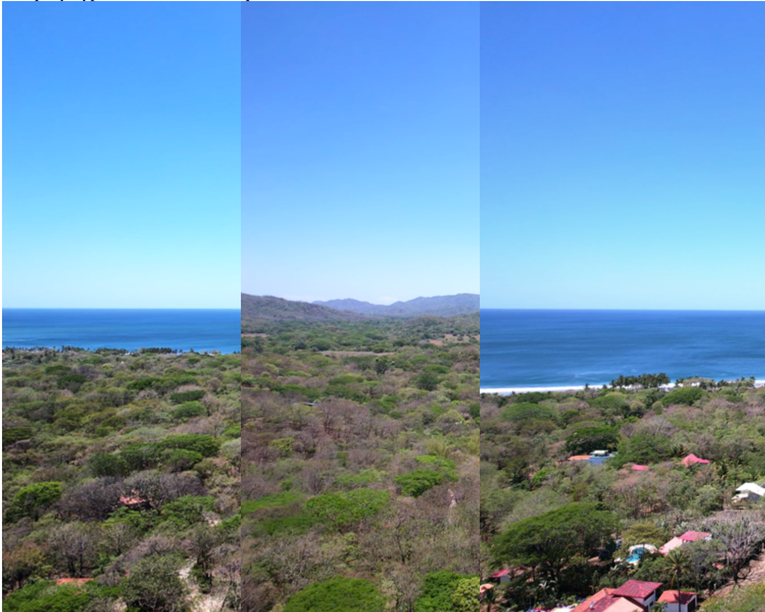
• Status: Active/Published