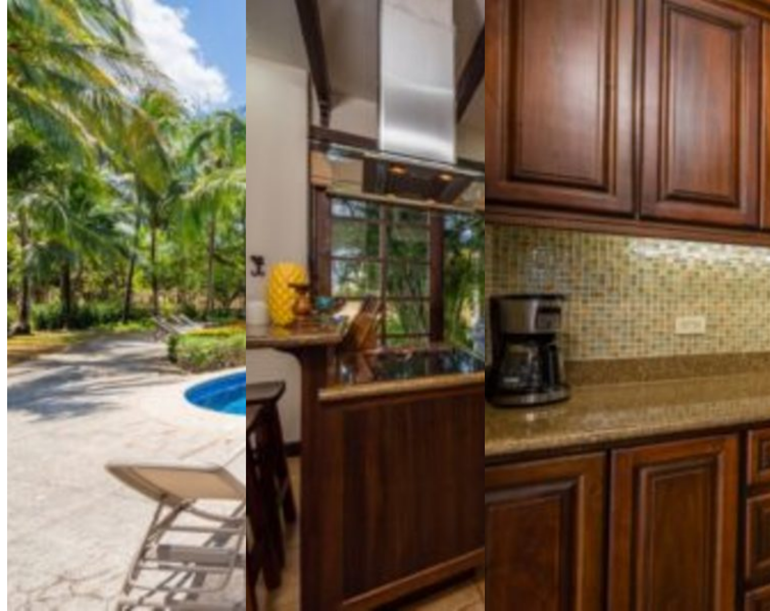
• Status: Active/Published

• Property Type: Condo • Bedrooms: 2 • Floor Area (SQFT): 33,788