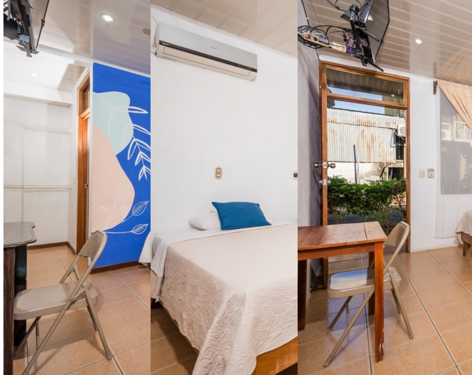
• Status: Active/Published

• Property Type: Hotel / Leisure • Bedrooms: 16 • Size: 800 sq m • 0.2 Acres