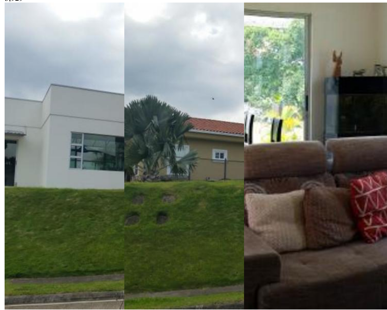
• Status: Active/Published

• Property Type: Condo • Bedrooms: 3 • Built: 2010 • Size: 700 sq m • 0.17 Acres • Floor Area (SQFT): 3,929